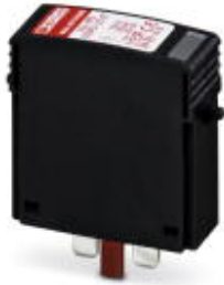
Replacement plug for PV arrester combinations of the VAL-MS 600DC... product range

Please be informed that the data shown in this PDF Document is generated from our Online Catalog. Please find the complete data in the user's documentation. Our General Terms of Use for Downloads are valid ( http://phoenixcontact.com/download )