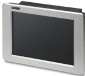
15-in. display shown

Please be informed that the data shown in this PDF Document is generated from our Online Catalog. Please find the complete data in the user's documentation. Our General Terms of Use for Downloads are valid ( http://download.phoenixcontact.com )