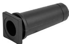
Cable Guard KT14 PVC Cable Guard for rewireable connectors