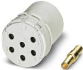
Contact insert, Number of positions: 12, Type of contact: Socket, Crimp connection

Please be informed that the data shown in this PDF Document is generated from our Online Catalog. Please find the complete data in the user's documentation. Our General Terms of Use for Downloads are valid ( http://phoenixcontact.com/download )